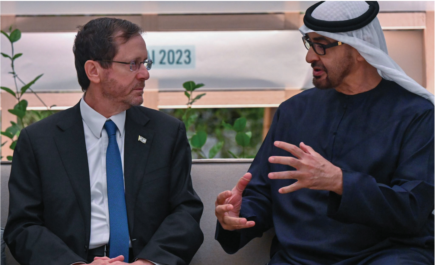
President Isaac Herzog meets with his Emirati counterpart President Sheikh Mohamed bin Zayed Al Nahyan in Dubai, November 30, 2023, on the sidelines of COP28

In 2023, ties between the countries of the Abraham Accords continued to deepen and flourish. Groundbreaking bilateral and multilateral forums were launched, numerous high-level visits took place, and previously-unimaginable joint initiatives brought together innovators, investors, experts, academics and women leaders from across the region. Economic ties reached new heights, with the estimated value of trade between Abraham Accords countries reaching $10 billion. 1 The values of tolerance, dialogue and mutual understanding at the heart of the Abraham Accords found expression in important interfaith and people-to-people developments.